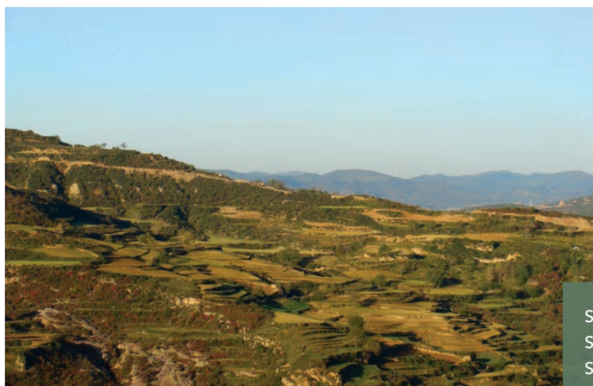
Sloping land agriculture in Shanxi Province (top). Song and the household head with the property title for the forests created on household's sloping cropland (bottom).

UNC LEADS INTERDISCIPLINARY RESEARCH TEAM TO ASSESS IMPACTS OF CHINA'S AMBITIOUS REFORESTATION POLICY