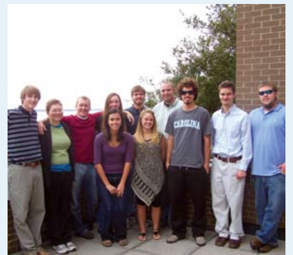
The students of the 2008 Morehead City Field Site